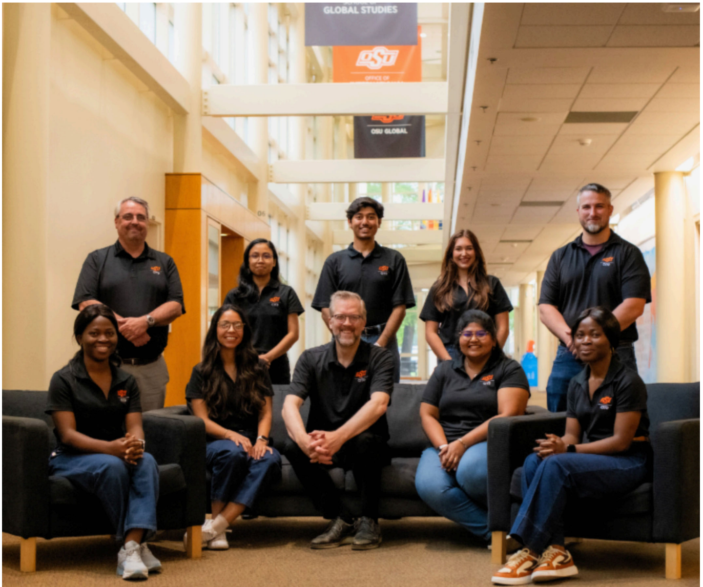
Our CITD Team: